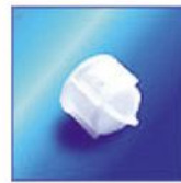
Built in Filter