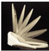
Hydraulic Seat & Lid

EASILY REPLACES MOST STANDARD TOILET SEATS